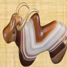
Harappan Bull with Gold Horns, Bhiwani (Haryana)